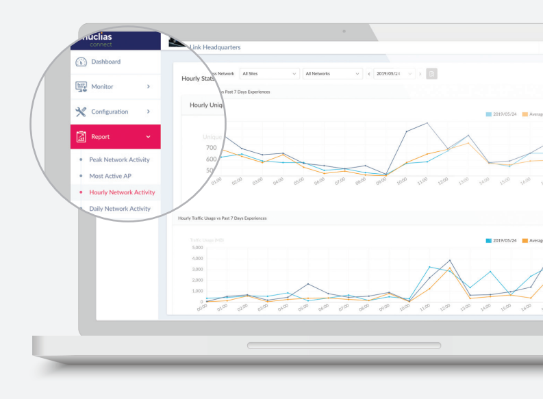
Statistics - Hourly Network Activity